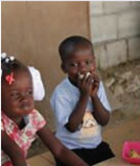
Above is the image of Project James' Facebook profile. Make sure to like and follow us!