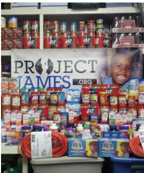
Above is the profile picture for Project James' Twitter feed. Follow us @ProjectJames127