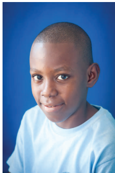
Top: Barckley Bottom: Dadelie