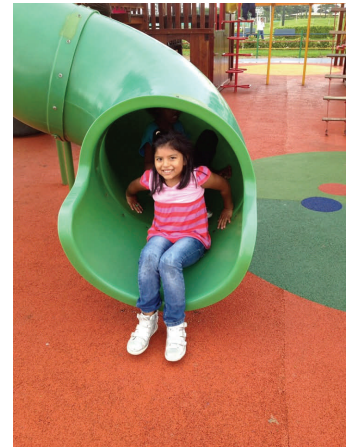
Top 2 photos: Two of the children enjoying the park.