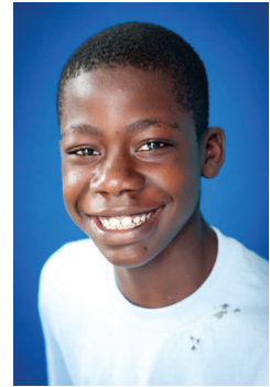
Top: Washlet Bottom: Roseleonne