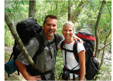
Top: atop the Koko Head Crater Trail overlooking Hunamo Bay.