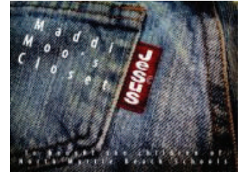
Maddi Moo's Closet logo

If you have or need to clean out your closets and drawers. We would love to have any of your gently used clothing except socks and underwear as we believe these items need to be new. Please call or email us if you have any childrens clothing to donate.